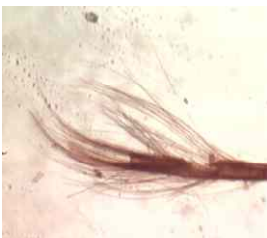
Pictured Left :- Plumose antenna of a non-biting midge. Extracted from a Daubenton's bat dropping.

Craig Macadam has already carried out some research regarding insect activity over our canals and during 2004 it is our intention to have, permanently in place, a Malaise Trap along with data logging equipment measuring water/air temperatures. The information collected, along with some other variables, will greatly improve our knowledge on the potential prey available to our foraging bats. As well as this it is hoped that analysis of bat droppings collected from one of our roosts nearby will help complete the picture. Craig has already been testing the techniques required in order to do this. To find out more access our Annual Report available via the website.