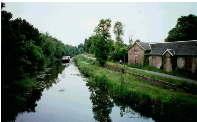
Jellyhill, Forth & Clyde Canal